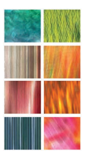
Sample Accent Designs (for more options, visit daavlin.com/neolux)